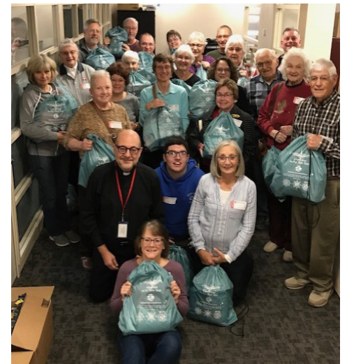
Members of Jerusalem Evangelical Lutheran Church in Lititz, PA, helped me (kneeling in black) assemble Christmas-at-Sea satchels in November 2023.