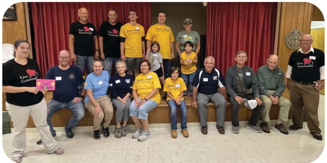
Gaining Skills and Confidence for Disaster Response Work skills training workshop hosted by Lutheran Disaster Response – Eastern Pennsylvania.

En este curso interactivo presentaremos los principios y acciones básicas de los primeros auxilios psicológicos, y explicaremos formas de aplicarlos en diferentes escenarios posteriores a un desastre y con diferentes necesidades de los sobrevivientes. Los primeros auxilios psicológicos — la práctica de reconocer y responder a las personas que experimentan estrés relacionado con una crisis — se pueden utilizar para ayudarse a uno mismo y ayudar a otros a enfrentar y superar incidentes estresantes.