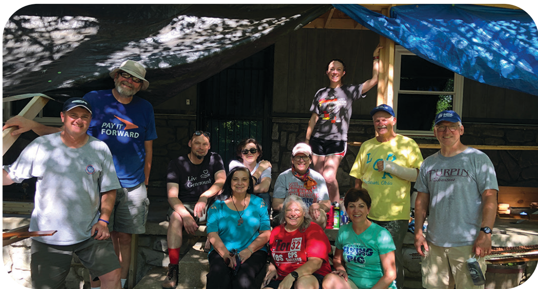
Members of the Lutheran Church of the Resurrection's Disaster Relief Team (Cincinnati, Ohio) in Mayfield, Kentucky, helping with the response to deadly tornadoes.

Join LDR's Midwest Region Community of Practice Discussion to network with peers and colleagues. This is a recurring, monthly online gathering.