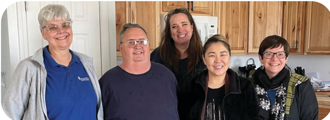
Sharing God's hope, healing and renewal with people whose lives have been disrupted by disaster.