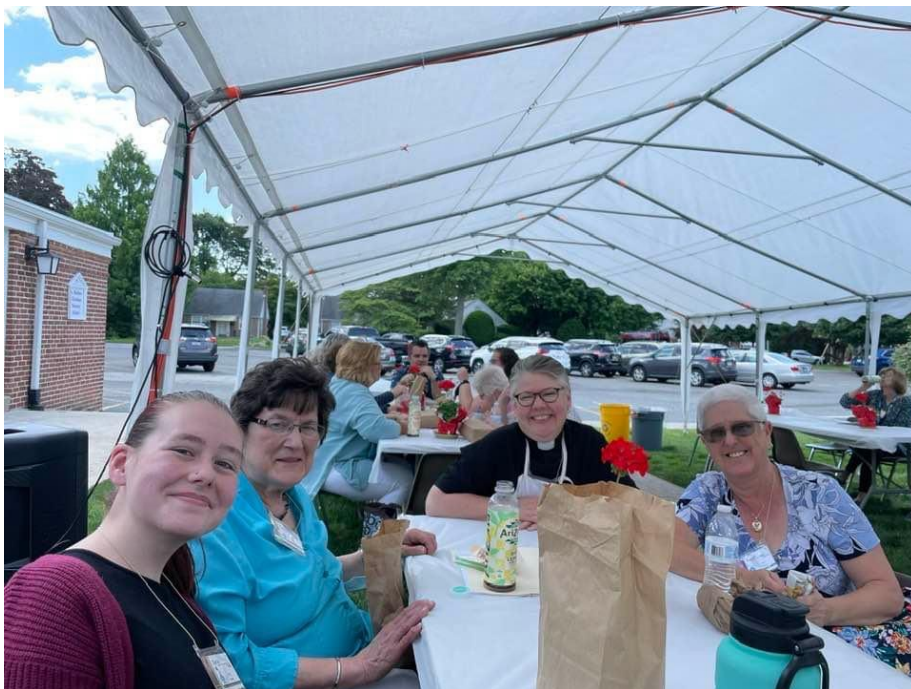
Lunch with some of the participants